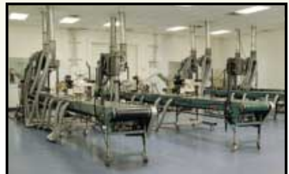
Mailing and Fulfillment