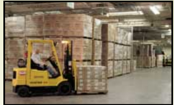
Warehouse Storage Facility