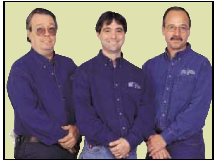
Our highly trained professional staff makes all the difference.

We are dedicated to outstanding customer service. Our creative engineering group employs state-of-the-art machinery throughout all operations for a wide range of packaging and assembly needs. Quality assurance programs are designed to exceed client specifications and monitored to ensure efficiency and regulatory compliance.