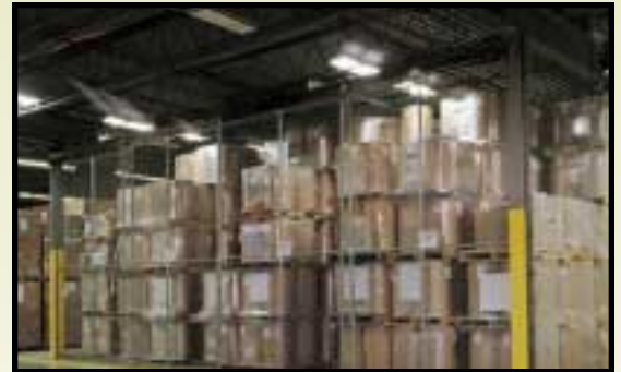
Locked Cage Storage Areas