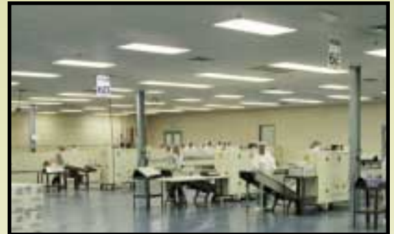
White Room Facilities

KIT ASSEMBLY AND PACKAGING • POINT-OF-SALE DISPLAY ASSEMBLY • SAMPLE FULFILLMENT • PRODUCT PACKAGING WITH PACKAGE INSERTS • COLLATING / INSERTING • DISTRIBUTION OF SALES REP LITERATURE / SAMPLES • SPECIAL LABELING & PACKING INCLUDING INTERNATIONAL REQUIREMENTS