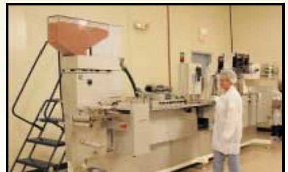
Bag and Pouch Filling